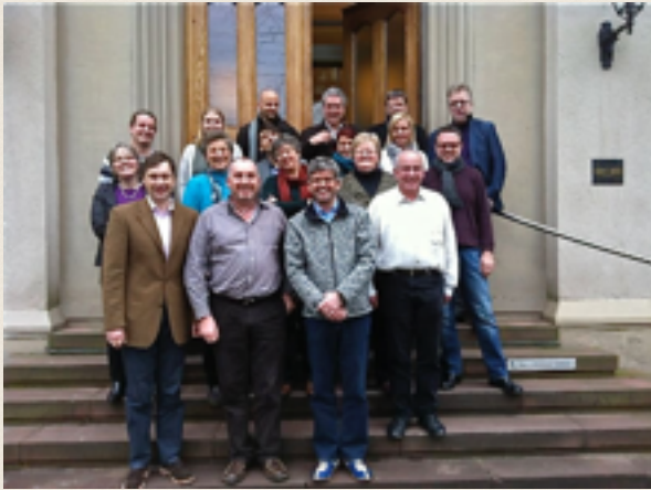
Meeting with the professional associations of Germany and Switzerland in Basel 2013