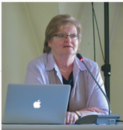
LECTURE AT SIBIU CONFERENCE, ROMANIA 2014